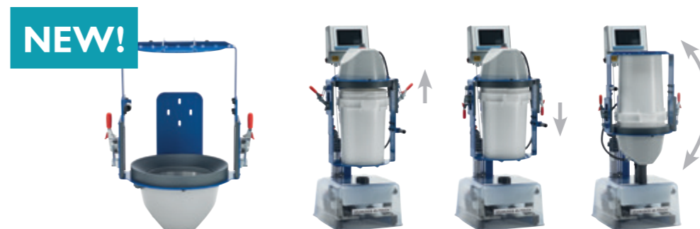
MULTIHOPPER FOR GRANUDOS 45/100

Universal drum holder and rotation drum carrier for GRANUDOS 45/100 systems.