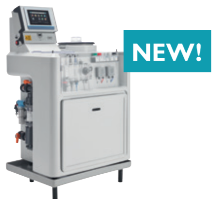
GRANUDOS-FLEX-CPR TOUCH XL