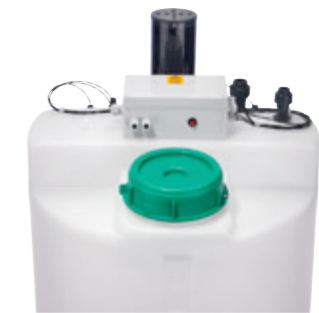
BUFFER TANK FOR GRANUDOS-PB