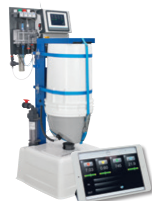
GRANUDOS 45/100-CPR TOUCH XL