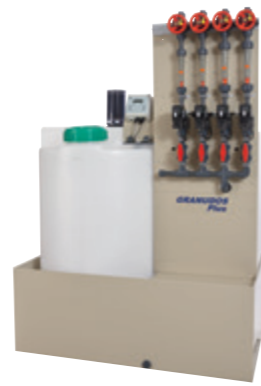
FEED SYSTEM FOR GRANUDOS PLUS