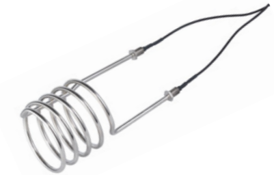
Resistor type heater elements in highly corrosion-resistant alloy