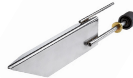
Replaceable stainless steel large area electrodes for different conductivities