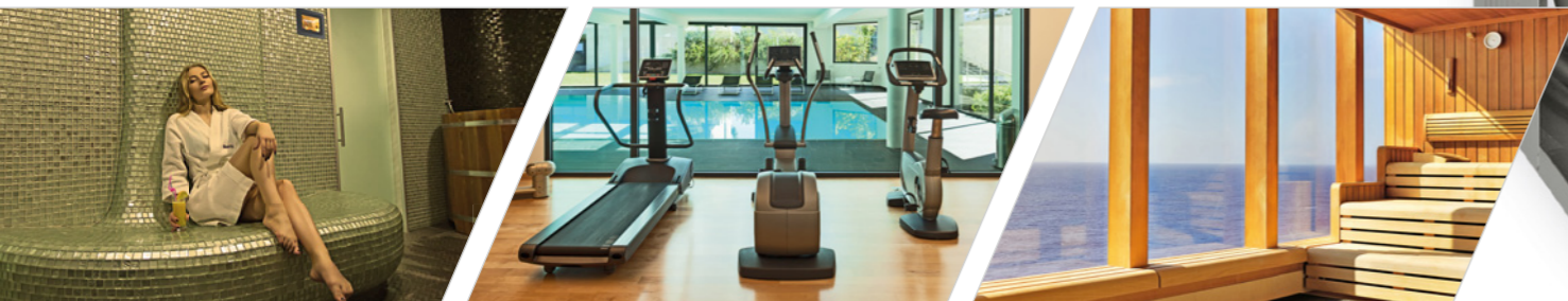
Spa resort and wellness hotel

The FlexLine basic model is the basis for all other configuration options. Through its individual extension capability, FlexLine is able to adapt to the requirements of differing applications in the spa and wellness sector.